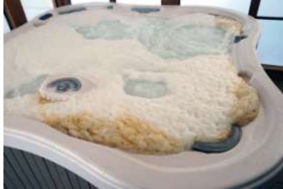
Even a brand new spa can exhibit biofilm buildup (foam and brown area appear during flushing process)

"It's not yet well known, but chlorine and other chemicals used to kill bacteria are actually absorbed by biofilm — rendering those chemicals ineffective — especially in the pipes, liners and other pool and spa areas." — Vance Fiegel, Microbiologist, Chief Scientific Officer, CWS